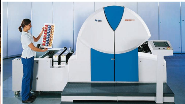
KBA Rapida 105 29' x 41' format 6/C; UV Interstation & IR dryers; 18,000sph; delivery and feeder Commercial Lithography Press. Next Genius 52 UV Waterless Press for Lenticular & Plastic 24Pt