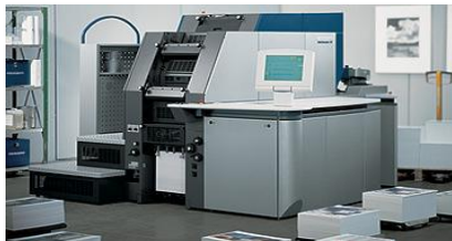
Heidelberg Water Offset Press QMDI-46-4