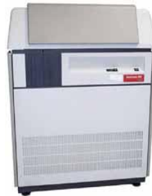
Linotype-Hell Imagesetter 300 Digital