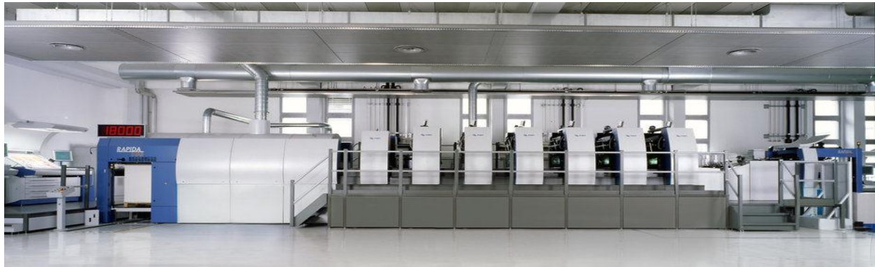
Demo Room in Dresden, Germany @ the KBA Factory I trained at on this Lg. Format 49 x 56" Format