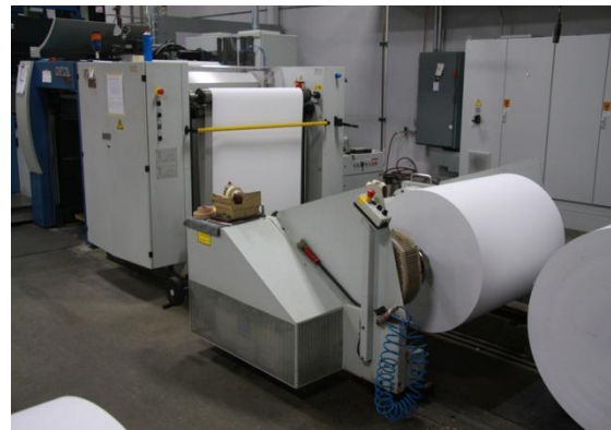
KBA Rapida 105 10/c Perfector; UV Dryers interstation 29" x 41" Format: 5/5 13,000sph; Mabec sheeter for roll fed to compete with the Web Press's but have the quality of offset.